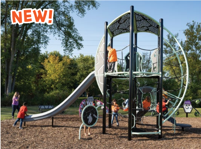
Nucleus Core™ NU-3069 SALE PRICE: $30,418*

Spring means warmer temperatures and the perfect time to bring play to your community with Burke's Spring into Play Sale! With more play structures than ever and some of our favorite Burke Fitness offerings, this sale has something for everyone and every space! You won't want to miss a savings of up to 40% on a variety of options to keep your entire community moving and playing together.