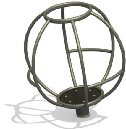
Comet II Spinner 560-2589 Ages 5-12 | 6 Kid Capacity | 16' Diameter ASTM Use Zone PRICE: $2,149**