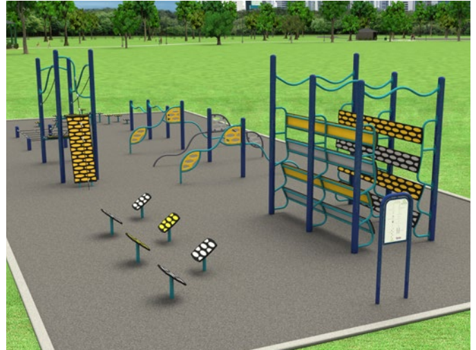
ELEVATE® FIT-2632 SALE PRICE: $48,830*