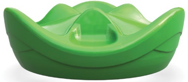
Volta® Inclusive Spinner 560-2579 Ages 2-12 | 9 Kid Capacity | 20' Diameter ASTM Use Zone PRICE: $7,160**