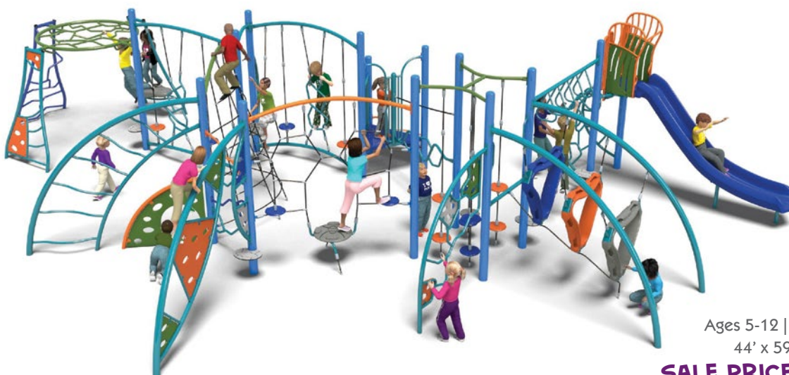
IN-2956 Ages 5-12 | 117 Kid Capacity 44' x 59' ASTM Use Zone SALE PRICE: $39,013*