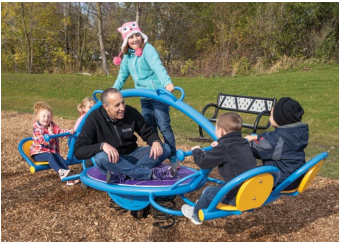
Orb™ Rocker 570-2709 PRICE: $8,264**

Bring more fun and fitness to your space with freestanding play and INVIGORATE® Dynamic Fitness. Add these products to new or existing play, recreation or outdoor fitness areas and keep your community moving!