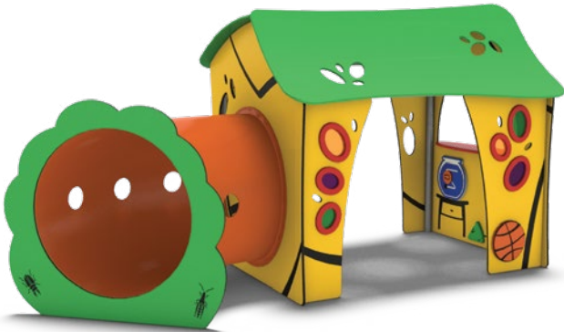
PlayHouse with Tunnel 580-1376 Ages 2-12 | 8 Kid Capacity | 16' x 16' ASTM Use Zone PRICE: $7,134**