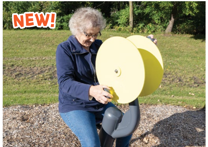
INVIGORATE® FIT-3112 PRICE: $2,428**

*Specifications and pricing subject to change without notice. Sale only applies to the Spring Sale structures. No modifications or changes other than color. Pricing does not include taxes, installation, surfacing or freight. Must order by June 30 th , 2022 and ship by September 30 th , 2022. Not applicable with any other offer, discount or grant program. Offer only available to customers in the 48 contiguous United States. Contact your local Burke Representative for details. **Approximate list price. Surfacing, freight, taxes and installation are extra.