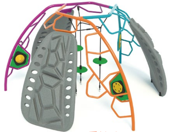
Dome3™ BB-3145 NEW! Ages 5-12 | 12 Kid Capacity | 24' x 24' ASTM Use Zone PRICE: $10,262**