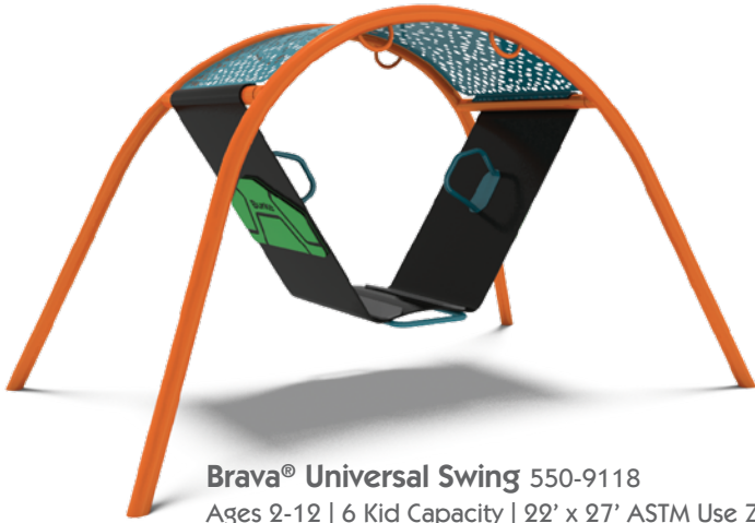
Brava® Universal Swing 550-9118 Ages 2-12 | 6 Kid Capacity | 22' x 27' ASTM Use Zone PRICE: $7,984**