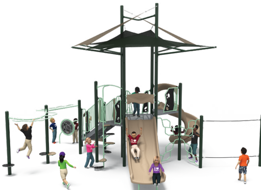
NUIN-3082 Ages 5-12 | 64 Kid Capacity 34' x 40' ASTM Use Zone SALE PRICE: $31,426*