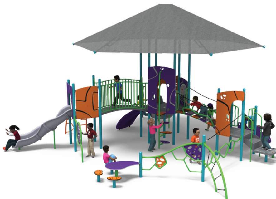
SY-3099 Ages 2-5 | 69 Kid Capacity 36' x 40' ASTM Use Zone SALE PRICE: $35,781*